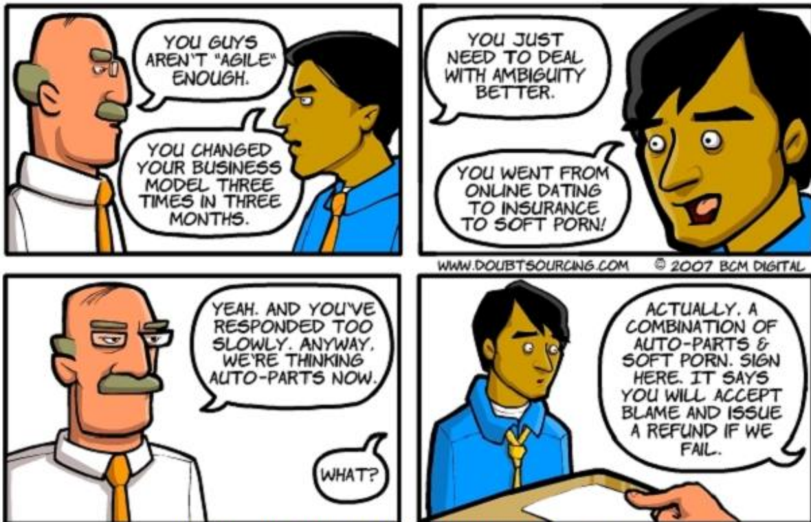
Figure 12: Indian Normative Transference: Indian worker portrayed as victim to unreasonable demands by Western client

Copyright permission granted by the artist , Mr. Sandeep Sood