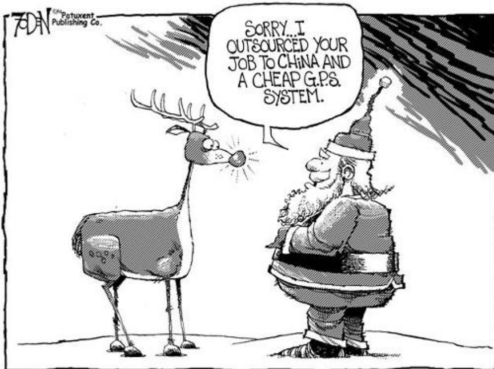
Figure 13. U.S./Western Reasons: Technology Enablement