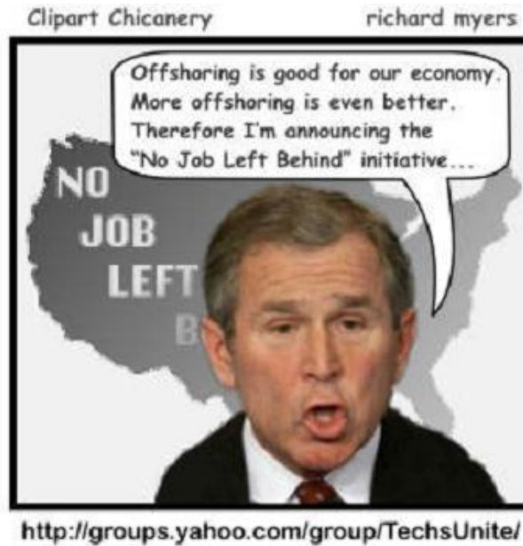
Figure 11: U.S./Western Normative Transference: Blame assigned to President Bush and implied victims are American workers.