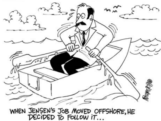
Figure 4. U.S./Western Narrative: “Worker sent to or seeks job in offshore country”