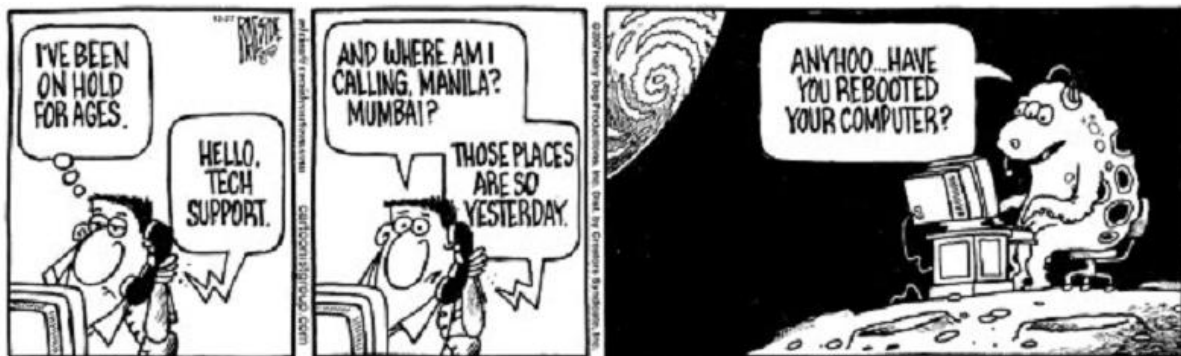
Figure 14. U.S./Western Consequences: Poorer Quality Service

Cartoon licensed from Cartoonistgroup.com