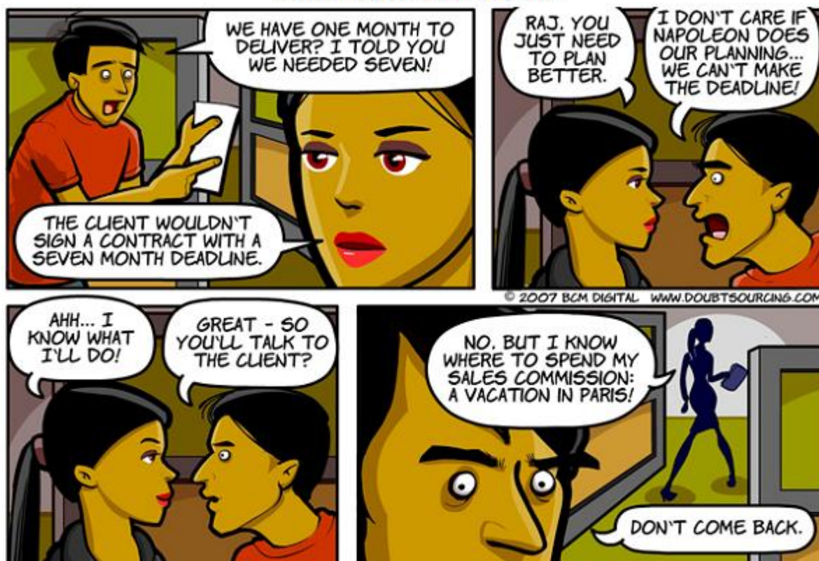
Figure 6. Indian Narrative: "Offshore supplier worker/manager conflict over wages, job duties"