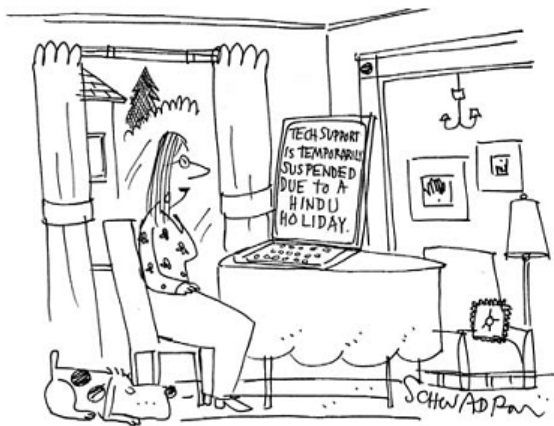
Figure 3. U.S./Western Narrative: “Consumer bears the negative consequence of outsourcing/offshoring”