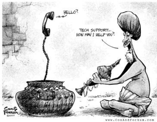
Figure 9: Domestication Location: Street; Familiar Signs: snake charmer, turban